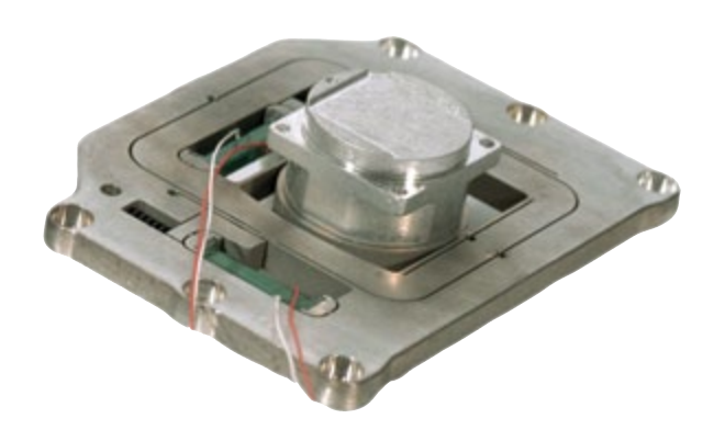
Highest precision piezo technology with the tightest tolerances for pixel-exact shifting in multishot exposures.